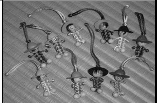
Learn Asian Arts and Crafts 學手工藝