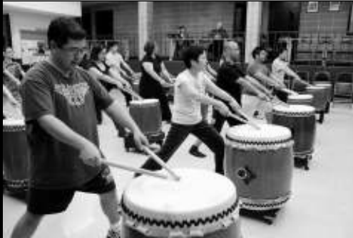
Learn Taiko Drumming 學太鼓

Asian Cultural Arts Summer Camp ( July 5th [Tues.] ~ July 9th [Sat.] )