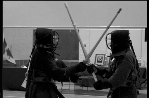
Learn Kendo 學劍道