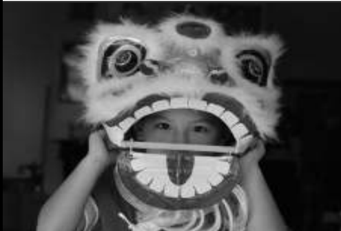
Learn Lion Dancing 學小獅王舞