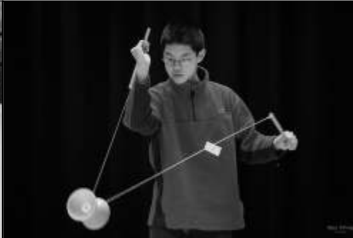
Learn Chinese Yo-Yo 學扯鈴